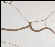
Calacatta Classic Gold